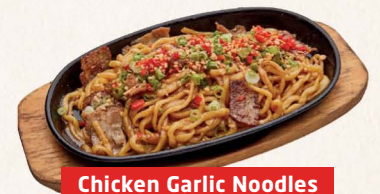
Chicken Garlic Noodles