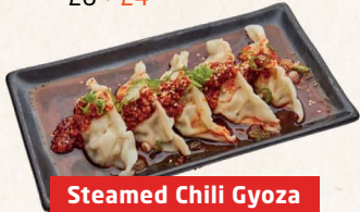
Steamed Chili Gyoza £6 • £5