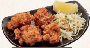
Chicken Karaage £6 • £4