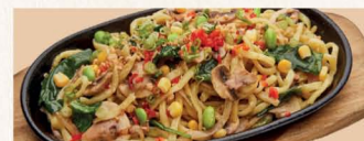
Vegetable Garlic Noodles £8