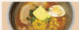
Miso Butter Ramen Pork £9