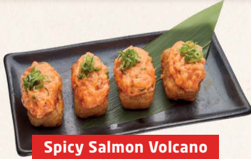
Spicy Salmon Volcano £8 • £7

Enjoy ALL DAY HAPPY HOUR only at the bar!