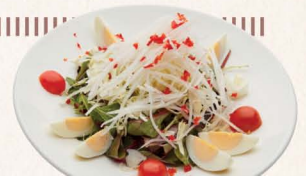
Kintan Salad £7 • £5