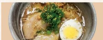
Goma Negi Ramen Pork £9