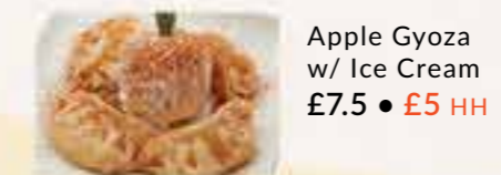
Apple Gyoza w/ Ice Cream £7.5 • £5 HH