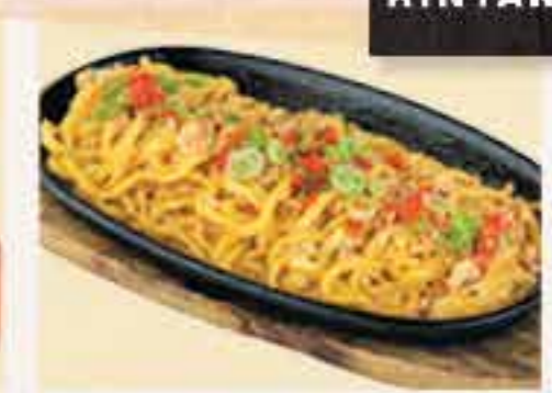
Chicken Garlic Noodles £10