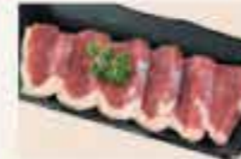
Duck Breast £9 • £8 HH Yuzu / Miso