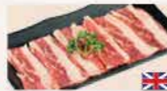
Toro Beef £8 • £7 HH Sweet Soy / Shio