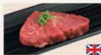
Filet Mignon £16 • £12 HH Ponzu / Sweet Soy