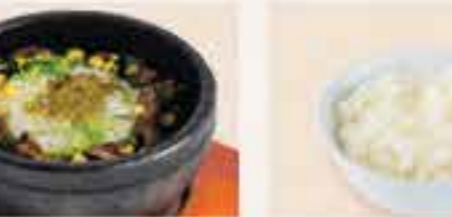
Pepper Beef Bibimbap £12 • £10 HH