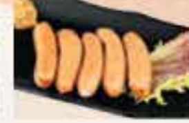
Japanese Style Sausages 5pcs £6 • £5 HH