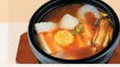
Seafood Tofu Chigae £14