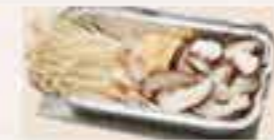
Mushroom Medley £6 • £5 HH