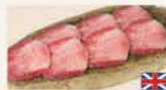
Beef Tongue £11 £12 w/ Negi Sauce