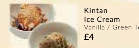
Kintan Ice Cream Vanilla / Green Tea £4