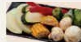
Assorted Vegetables £8 • £6 HH