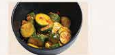
Spicy Addicting Cucumber £6 • £5 HH