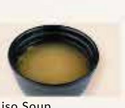
Miso Soup £3 • £2 HH