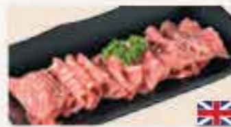
Yaki-Shabu Beef £7 • £5 HH Miso / Shio