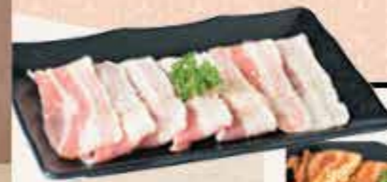
Pork Kalbi £9 • £7 HH Shio / Miso