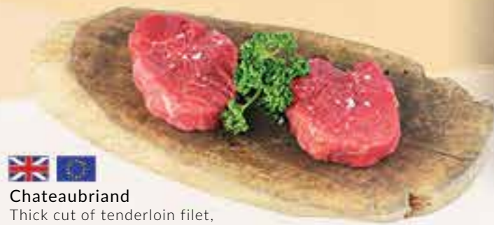
Chateaubriand Thick cut of tenderloin filet, deliciously tender and low-fat texture £27 • £22 HH Ponzu / Sweet Soy