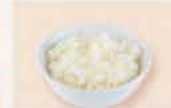
Steamed Rice £3