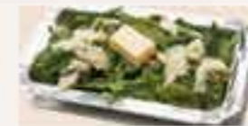
Garlic Spinach £5 • £4 HH