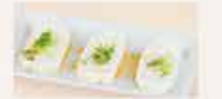
Halloumi Cheese £5 • £3 HH