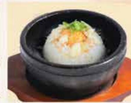
Garlic Fried Rice £9 • £7 HH