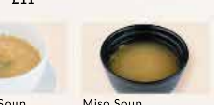
Egg Drop Soup £3 • £2 HH