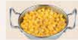
Butter Corn £6 • £3 HH