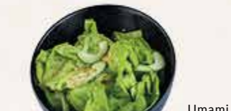
Umami Salad £5 • £4 HH