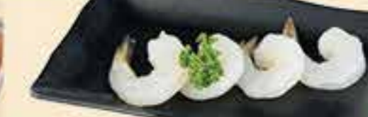
Tiger Prawns £9 • £7 HH Garlic / Basil