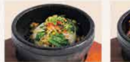
Vegetable Bibimbap £9 • £7 HH