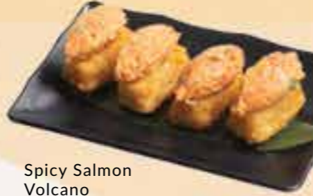
Spicy Salmon Volcano £9 • £8 HH