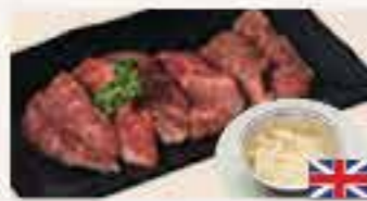
Garlic Butter Kalbi Short Rib £11 • £9 HH