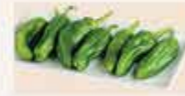
Padrón Peppers £4 • £3 HH