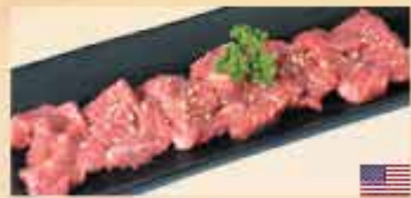
USDA Premium Flat Iron £13 • £11 HH Ponzu / Sweet Soy