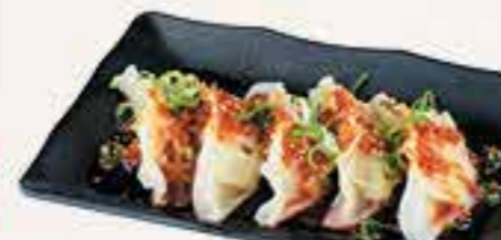
Steamed Chili Gyoza £7.5 • £6 HH