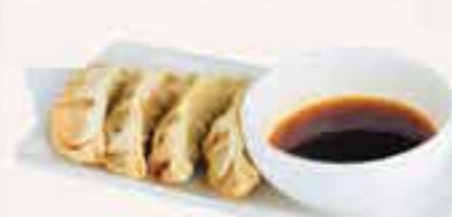
Chicken Gyoza £6 • £4 HH