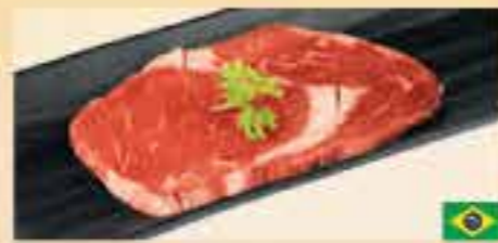
Premium Rib Eye £12 • £10 HH Sweet Soy / Ponzu