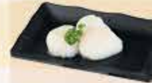
Scallops 3pcs £9 Miso / Shio