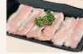
P-Toro Pork Jowl £7 • £6 HH Shio / Wasabi Soy