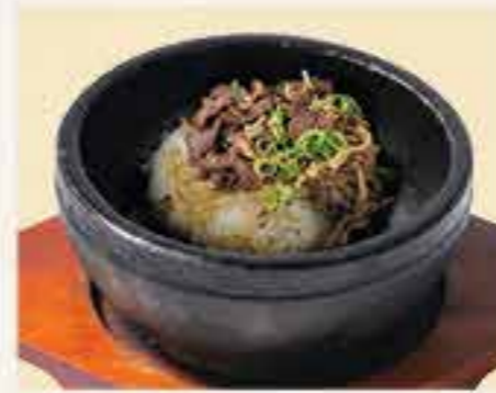
Beef Sukiyaki Bibimbap £12 • £10 HH