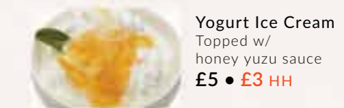
Yogurt Ice Cream Topped w/ honey yuzu sauce £5 • £3 HH