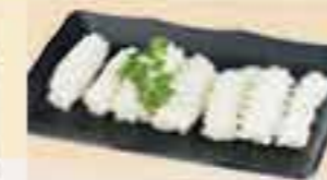
Squid £6 • £4 HH Miso / Sweet Soy & Garlic