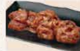
Spicy Chicken £7 • £5 HH