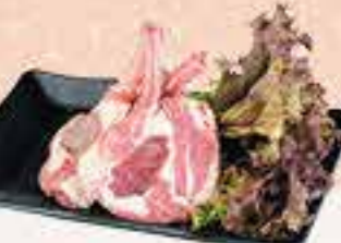
Lamb Chops £9 2pcs £17 4pcs Basil / Garlic