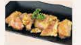
Chicken Basil £7 • £5 HH