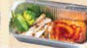
Miso Butter Salmon £7 • £5 HH