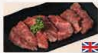
Kalbi Short Rib £10 • £8 HH Sweet Soy / Shio