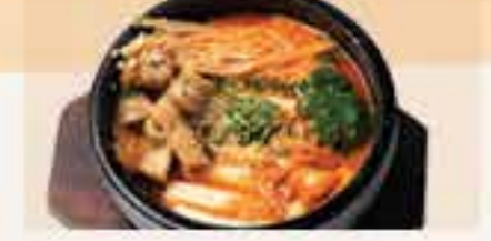
Tofu Chigae Ground Chicken / Pork / No Meat £11