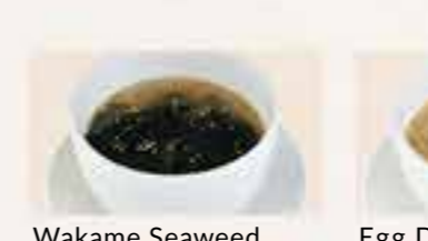
Wakame Seaweed Soup £3 • £2 HH