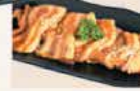
Spicy Pork £9 • £7 HH