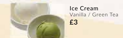
Ice Cream Vanilla / Green Tea £3