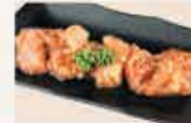
Chicken Teriyaki £7 • £5 HH