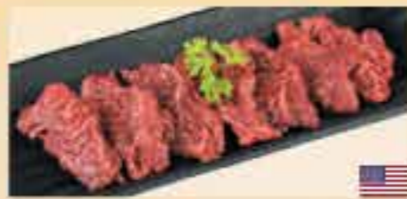
USDA Premium Bistro Hanger Steak £13 • £11 HH Miso