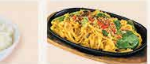
Vegetable Garlic Noodles £10