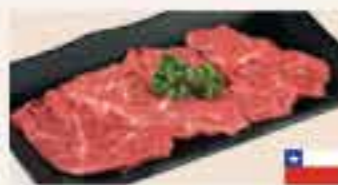
Rosu Sliced Rib Eye £9 • £7 HH Sweet Soy / Ponzu