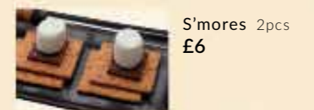
S'mores 2pcs £6