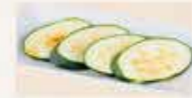
Courgette £4 • £3 HH