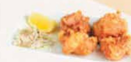
Chicken Karaage Small £7 • £5 HH Large £12 • £8 HH