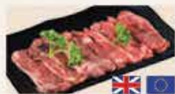
Harami Skirt Steak £9 • £7 HH Miso / Sweet Soy / Garlic