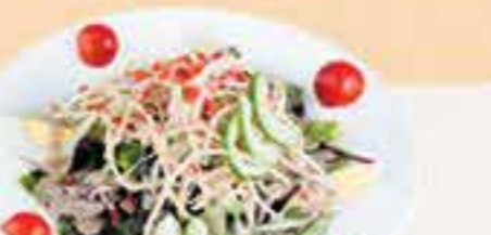
Kintan Salad £5 • £3 HH