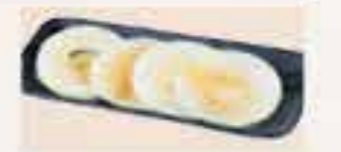
Sweet Onion £4 • £3 HH