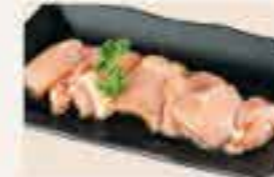
Chicken Garlic £7 • £5 HH